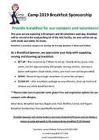
Breakfast Sponsorship Flyer