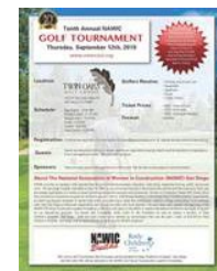
Download Registration & Sponsorship Form