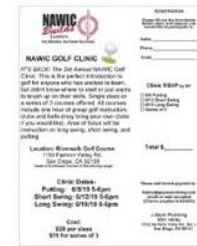
Download Registration Form