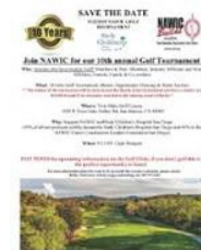
Download Save the Date